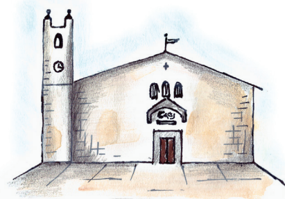
EXHIBIT AND INFO POINT